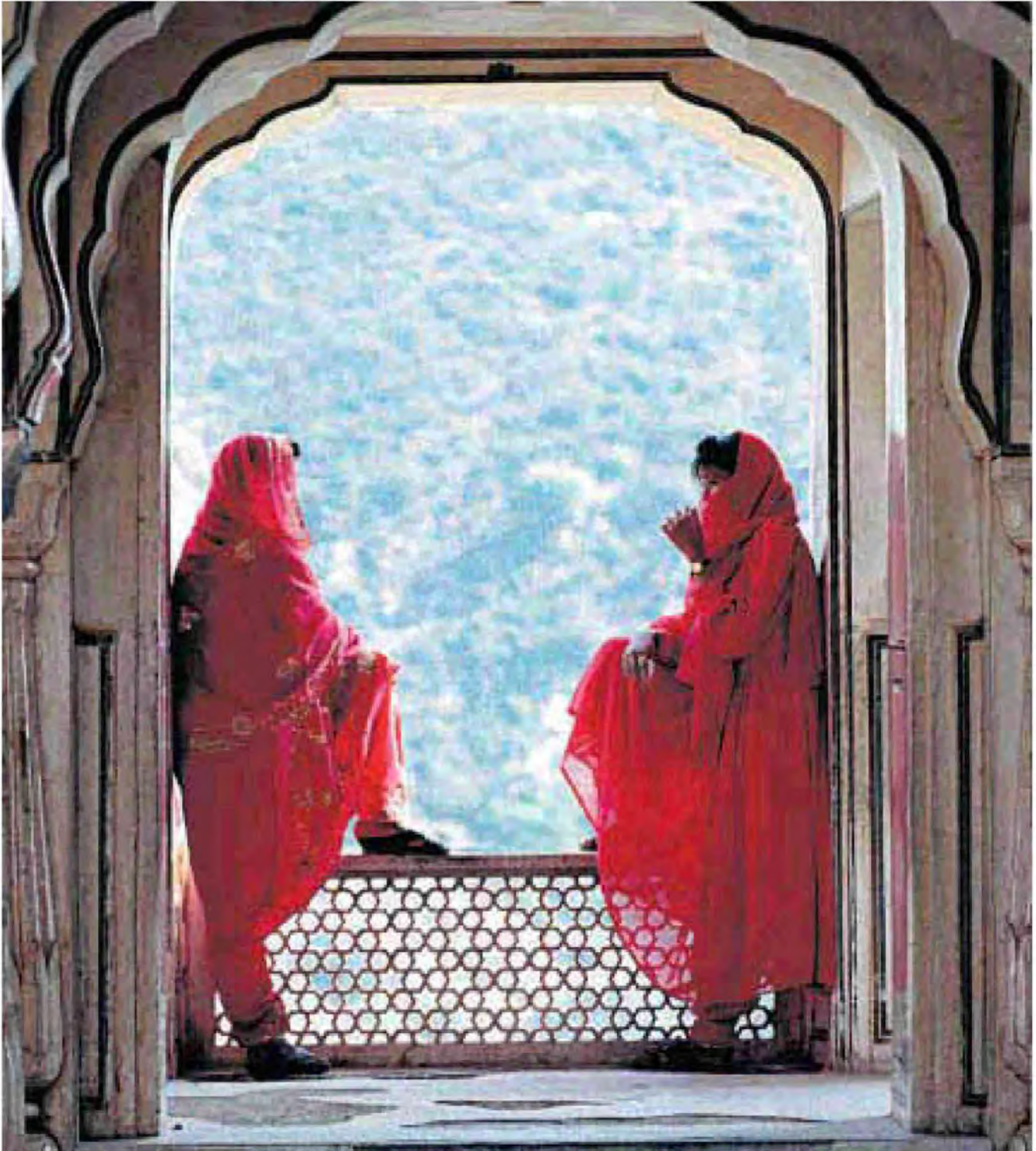
The Amber Fort at Jaipur is popular with tourists but Rajasthan has other attractions off the beaten track